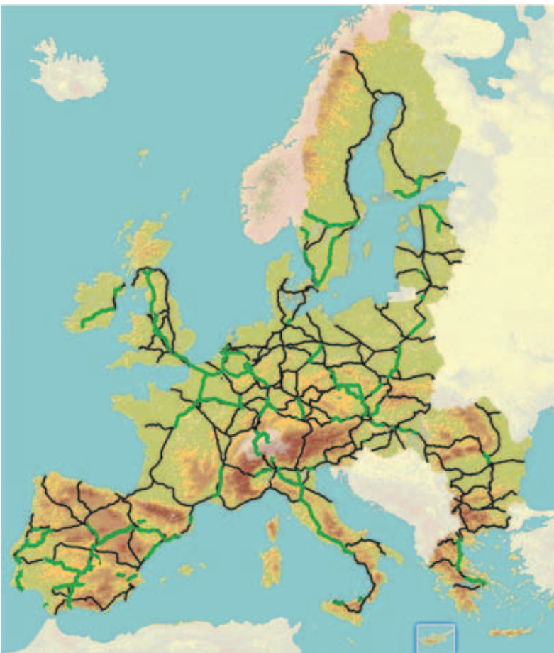
Figure 2 The TEN-T priority projects (hick lines) and the envisioned core network